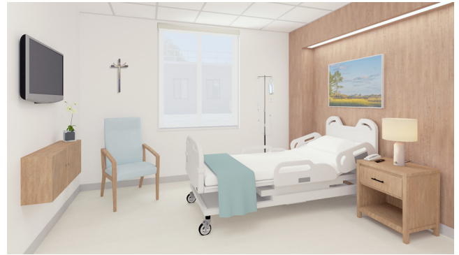
Extended Treatment Room

“ We have an outstanding OPIC staff at RGH, and having an updated, modern facility will allow them to provide top level care for those patients. ”